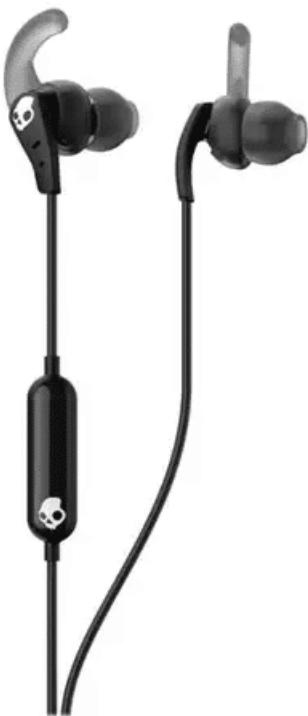
Skullcandy Set Microphone