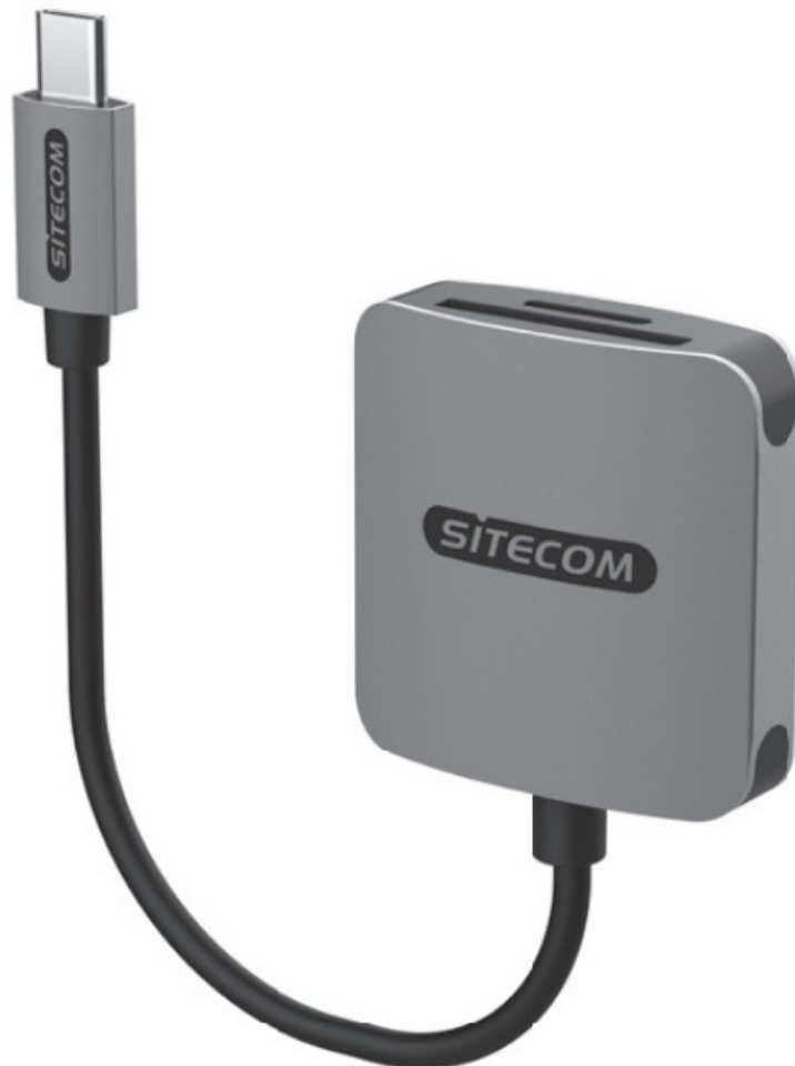
USB-C Card Reader UHS II Type: MD-1010