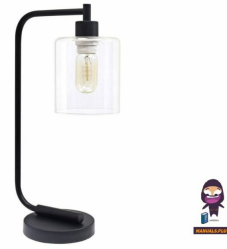
Simple Designs LD1036 Glass Shade Table Lamp