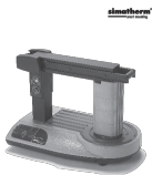
Induction Heater IH 210

Bedienungsanleitung für das Induktionsheizer Modell IH 210 Version 1.0