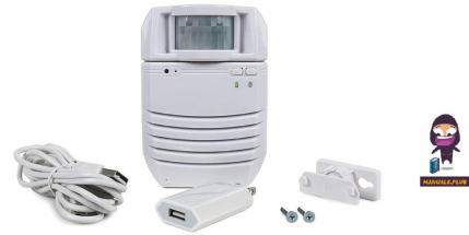
SierraTeck B01M70GV41 Smart Sound Motion Activated Sound Player