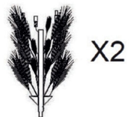
Lower parts of the Christmas tree