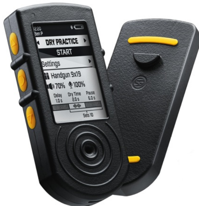
SG TIMER 2 VERSION: SST4A.02