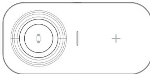
2-in-1 wireless charging pad