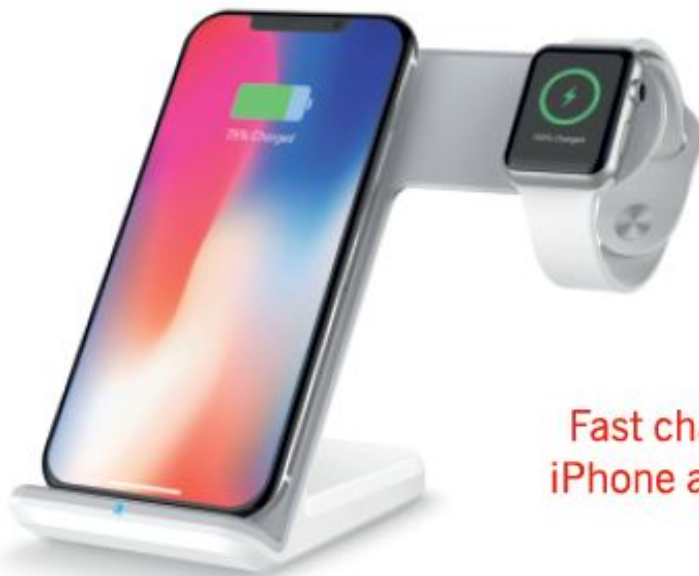
Fast charging simultaneously iPhone and Apple Watch 2 in 1