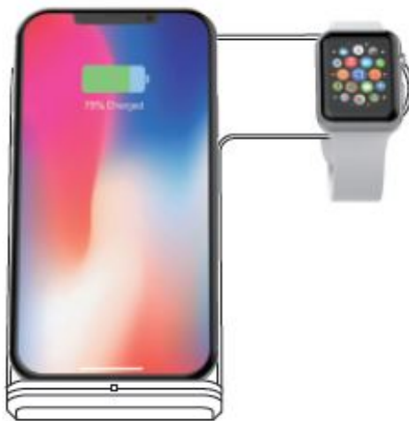
Fast charging vertically