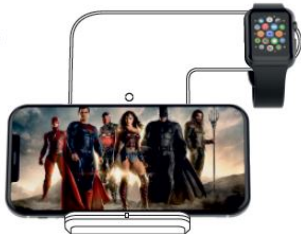
Fast charging horizontally