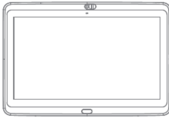
MEDICAL INDUSTRY DIGITAL SIGNAGE