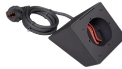
Shelly Shelly CEE 7-3 Wall Display Stand