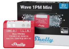
Shelly Qubino Wave 1 PM Mini Relay Switch