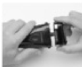
FIG. 2 REMOVE THE SHAPER HEAD FROM THE BODY (FIG. 2).