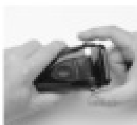
FIG. 1 HOLD THE SHIVER FIRMLY WITH ONE HAND ON THE SHAPER HEAD AND ONE HAND ON THE BODY (FIG. 1).

With normal use, the foils should last a long time. However, if the foils become damaged, you can replace them easily at home. For best performance, it is recommended to change the blades at the same time as the foils.