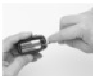
FIG. 3 USING A SMALL BLADE OR SCREWDRIVER, CAREFULLY LIFT OUT THE FOILS FROM THE SIDE, ONE AT A TIME (FIG. 3-4).