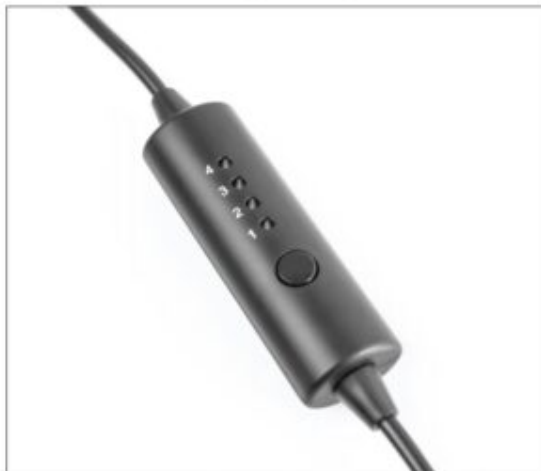
FIG. 2: WIRED CONTROLLER