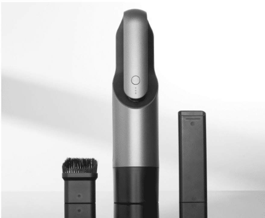
Handheld Cordless Spot Vacuum Sharper Image 207363

Thank you for purchasing the Sharper Image Handheld Cordless Spot Vacuum. Please take a moment to read this guide and store it for future reference.