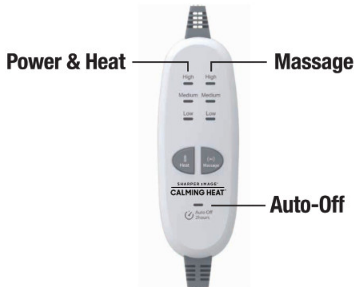
BUTTON SYTLE DELUXE RATING: 120V 60Hz 110W

NOTE: After a power outage, the Auto-Off feature automatically resets the timer.