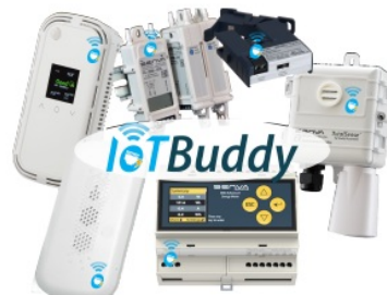
Fits in slim enclosures and junction boxes