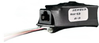
Option for POE (Power over Ethernet)