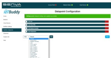
Choose pre-configured or configure your own