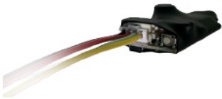
Wireless version connects to (2.4 GHz) networks