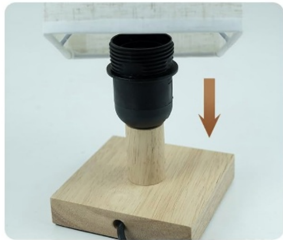
2 Place lampshade on the bulb base