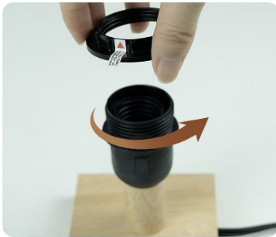
1 Unscrew the nut on the bulb base