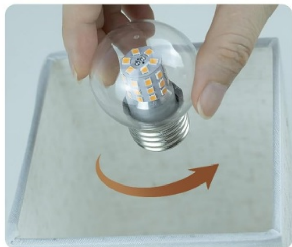
4 Install the E26 bulb