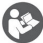
Refer to instructions

IMPORTANT: PLEASE READ THESE INSTRUCTIONS CAREFULLY. NOTE THE SAFE OPERATIONAL REQUIREMENTS, WARNINGS & CAUTIONS. USE THE PRODUCT IS CORRECTLY AND WITH CARE FOR THE PURPOSE FOR WHICH IT IS INTENDED. FAILURE TO DO SO MAY CAUSE DAMAGE AND/OR PERSONAL INJURY WILL INVALIDATE THE WARRANTY. KEEP THESE INSTRUCTIONS SAFE FOR FUTURE USE.