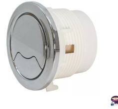
Screwfix C360116 Pneumatic Push Button