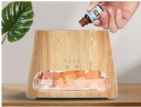
Add your pure essential oil