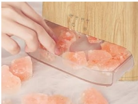
Put the salt rock in container