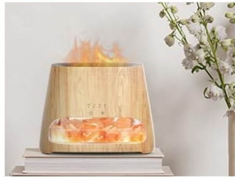
Now enjoy the fragrance