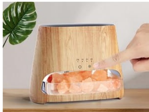
Press the light button