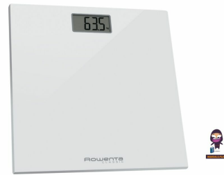
RowenTa BS1131V0 Electronic Scale