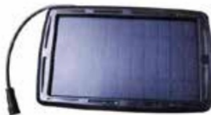
1x Solar Panel