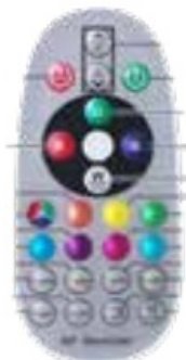
1x Remote Control