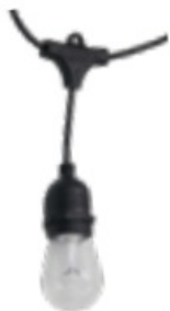
1x String Lights