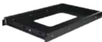
1x Fridge Slider