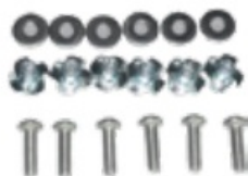
Mounting Kit 6 x M6 washers 6 x M6 tee nuts 6 x M6 x 20mm bolts