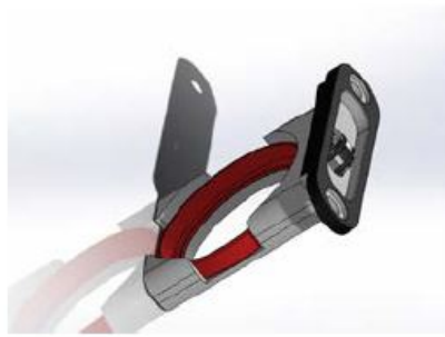
Gobo positioning wheel