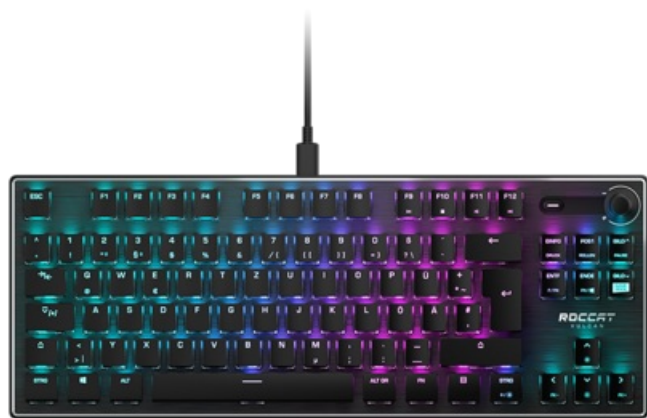
Roccat VULCAN TKL Keyboard