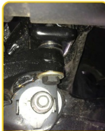
6mm spacer installed into diff mount under passenger side of vehicle