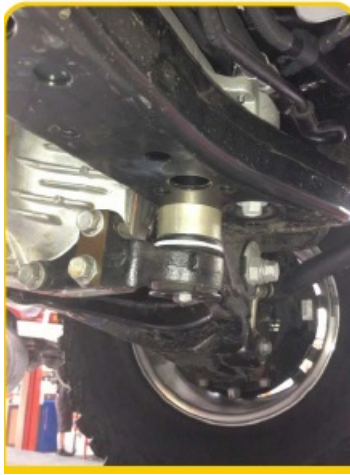
Close up of passenger side main spacer