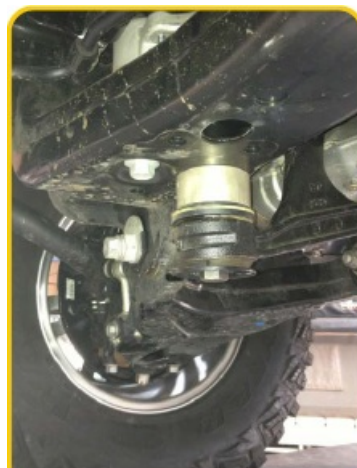
Close up of driver side main spacer