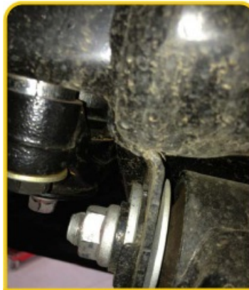
Shows small 6mm spacer installed into diff mount under passenger side of vehicle (side view)