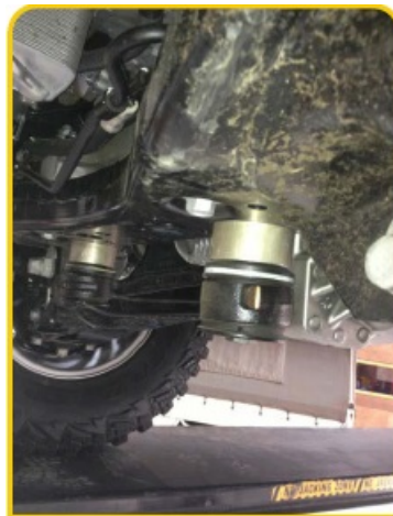
Shows two main spacers installed from rear view

Suitable for Landcruiser 200 Series. Designed to allow for the front diff to be lowered by 25mm, thus reducing the angles CV joints need to operate on. Suitable for vehicles with KDSS and 2016 models.