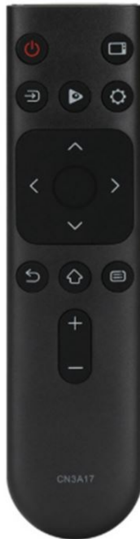
Remote control button map