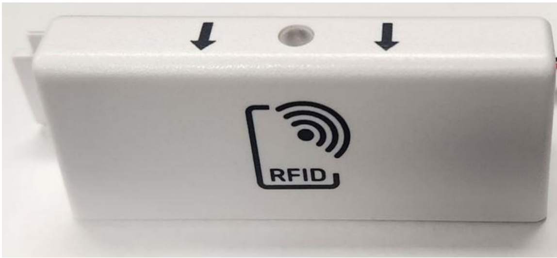
WAVE ID ® Mobile Reader Model: WF30100

This document provides the following information: