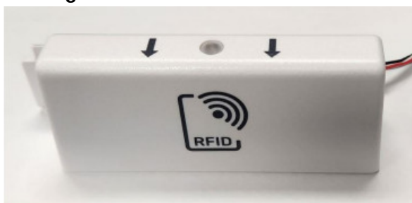
Wave ID ® Plus Reader

This document provides the following information: