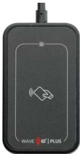
WAVE ID® Desktop Mini