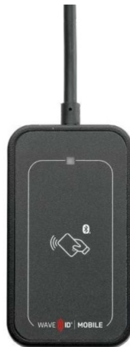
WAVE ID® Mobile Mini