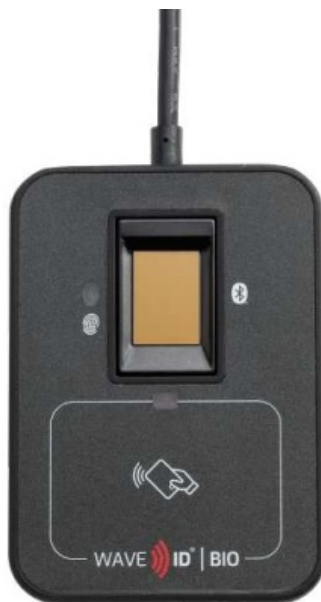
WAVE ID® Bio