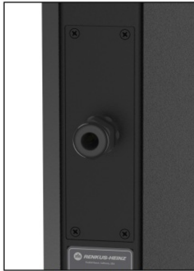
UBX Series Input Pocket Cover