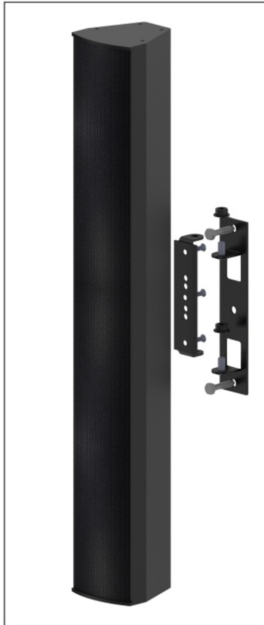
UBX8 and Wall Mount