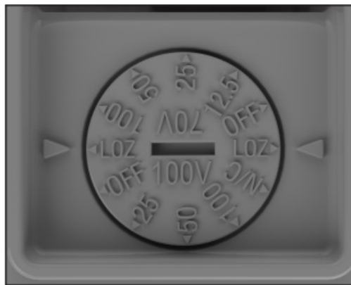
UBX8 & UBX16