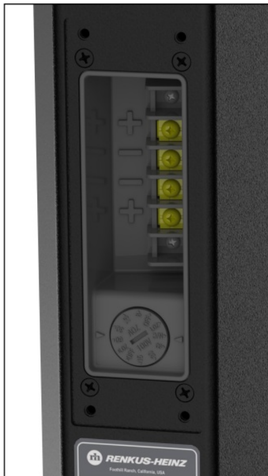
UBX Series Input Pocket