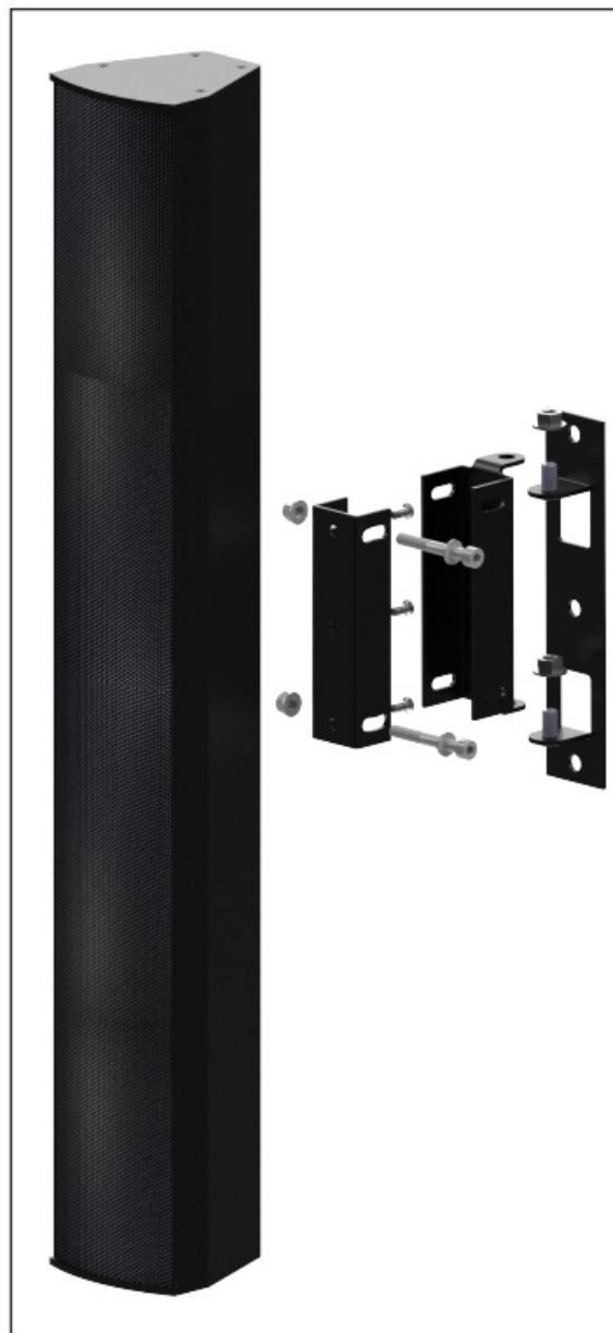
UBX8 and Pan/Tilt Wall Bracket

The UBX Series was designed to address most installations with surface-mounting plumb to the wall via the included wall bracket. For more extreme applications, Renkus-Heinz developed an optional Pan/Tilt Wall-Bracket, part number W-WALL-UBX-PT.