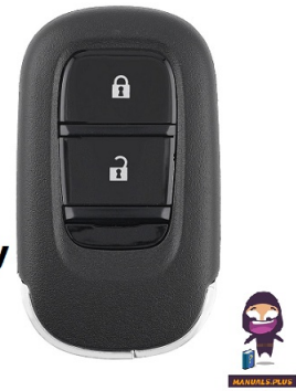
Remote Tech RT-KR5TP2 Electronic Key