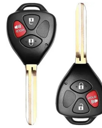
Remote Tech RT-HK7F20 Electronic Key