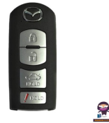
Remote Tech RT-13D0 Smart Key