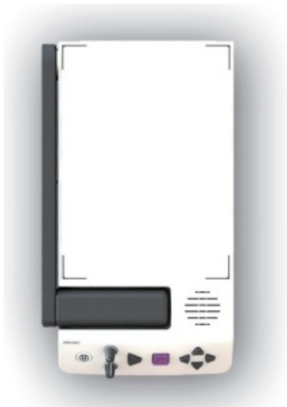
Figure 1: Top view

The scanning camera with integrated LED lights is positioned into the device when it is not in use or in transport position. The camera arm is located at the left side of the device and must be lifted to bring it into reading position.