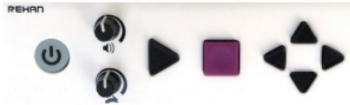
Figure 2: Front view

All user controls are positioned at the front of the device. The functions of these buttons vary as a result of the mode the device is in. Read this manual for the functionality of the user controls.