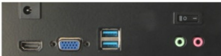
Figure 4: Rear view

The power adapter input is located at the upper left side and is detected as a rectangular box with a small hole to connect the power adapter output plug.