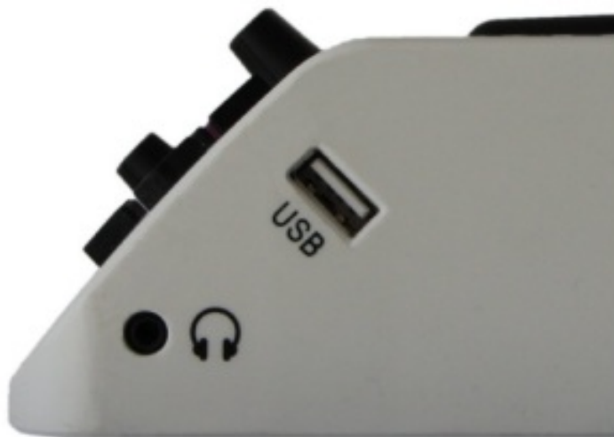
Figure 3: Right side view

At the front right side there is a rectangular slotted hole with a USB2 connection. The headphone connection is located at the lower right side and is detected as a round hole.