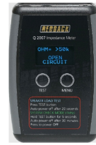
REDBACK Q2007 Impedance Meter