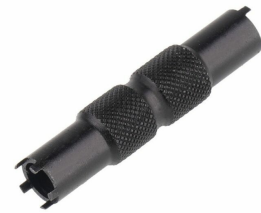
REAL AVID AVAR15FSA Front Sight Adjuster