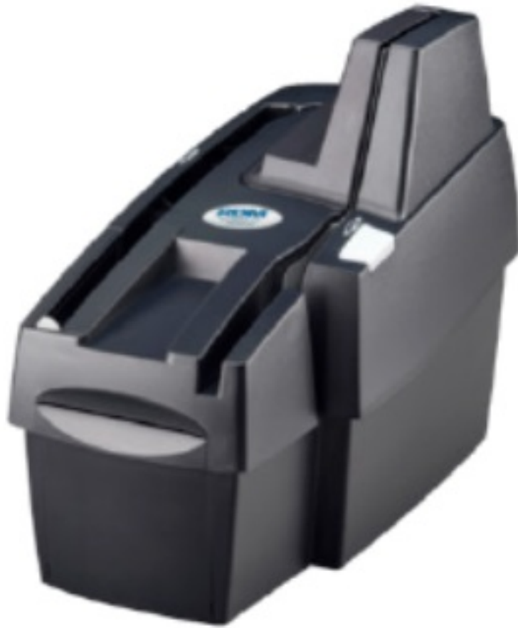
EC9700i AF Network Series Scanner