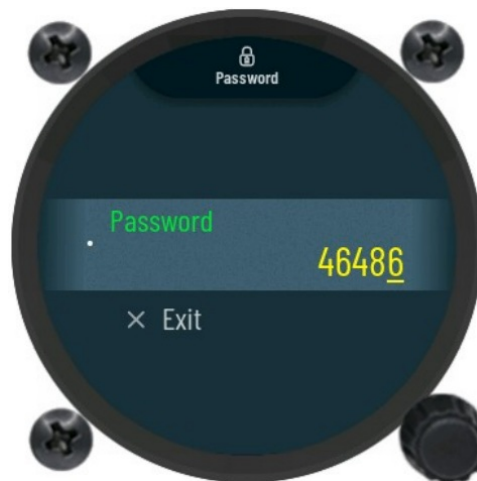
Figure 9: Password sub-menu reference.