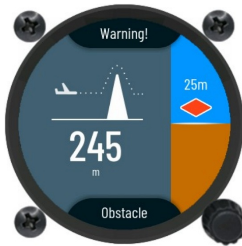
Figure 12: Obstacle warning view.

Zone warning will be triggered if the pilot is getting close to the prohibited zone. Type of zone is also displayed in the large gray area of the display.