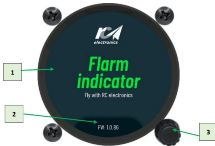
Figure 1: Reference front view of the unit. Also the Flarm Indicator intro screen.