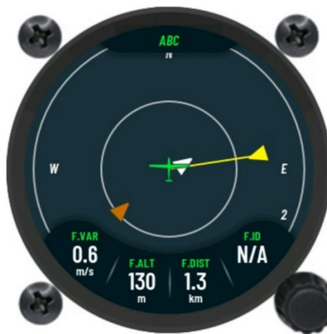
Figure 2: Flarm Radar reference page.

With the externally connected Flarm device into a data port of the Flarm Indicator, nearby objects can be viewed on the main Flarm radar page . Displayed graphical radar with additional numeric information on the main screen will give the pilot quickly needed information about the surrounding objects.