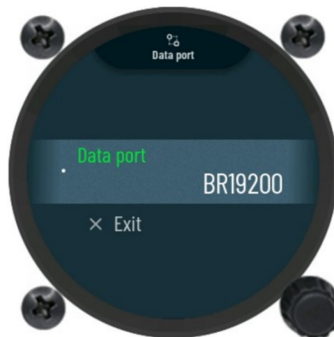
Figure 7: Data port sub-menu reference.

Data port communication speed applies the same for data port 1 and data port 2.