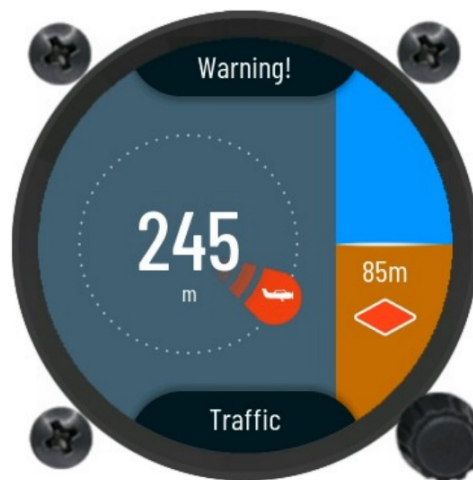
Figure 11: Traffinc warning view.

Red rhombus will indicate if the nearby aircraft is located below or above from our current height.