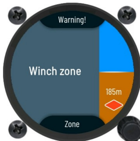
Figure 13: Zone warning view.

Red rhombus will indicate, if for the nearby zone is higher or lower.