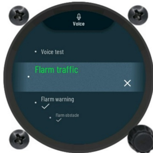
Figure 5: Voice sub-menu reference.