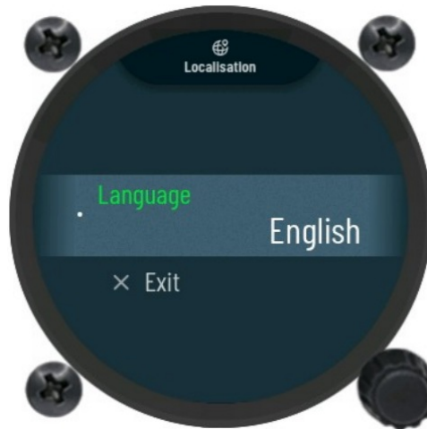
Figure 8: Localization sub-menu reference.

Local settings can be set in the Localization sub-menu, containing preferred language. Pilot can choose between English and German language.