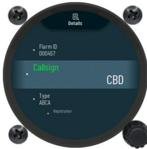
Figure 4: Details sub-page reference.