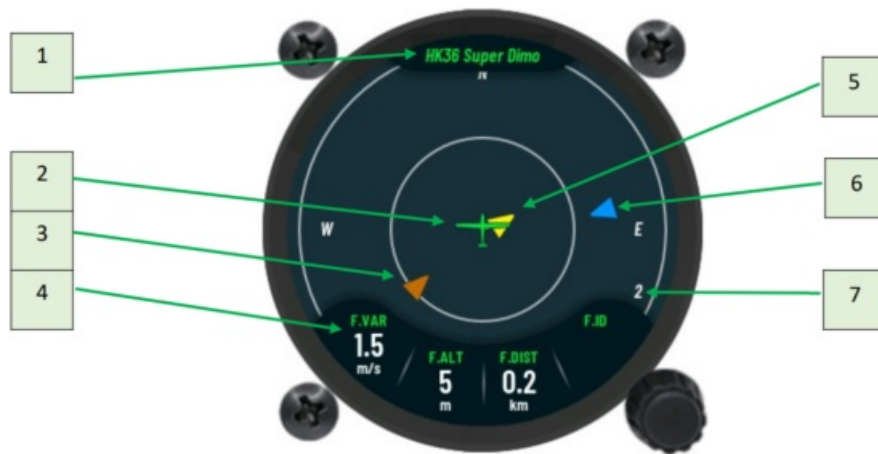
Figure 3: Flarm Radar reference.