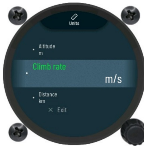
Figure 6: Units sub-menu reference.