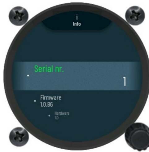
Figure 10: Info sub-menu reference.