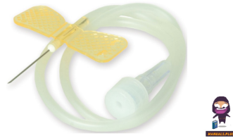
RAYS Scalp Vein Sets