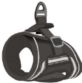
1 * rabbitgoo Vest Harness