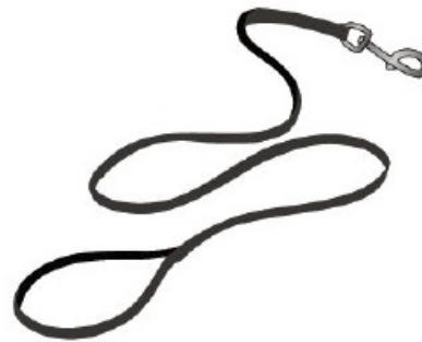
1 * rabbitgoo Nylon Leash (450cm)