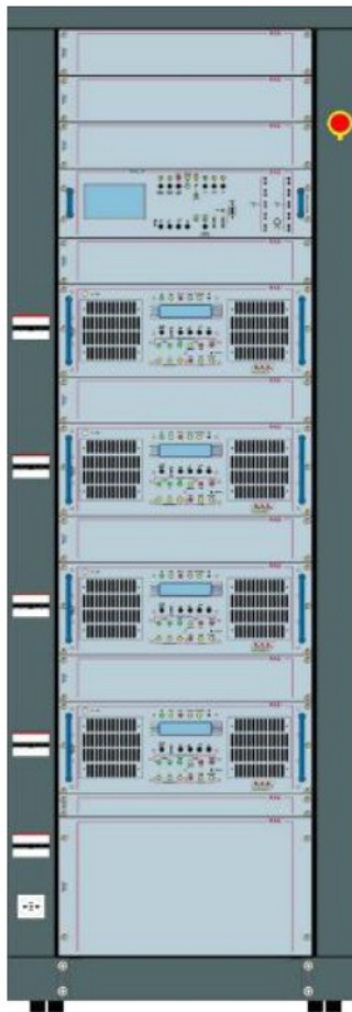
PJ20K-KLC 20.000W Liquid cooled system.