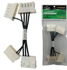
Qwik QT6110 ECM Adapter