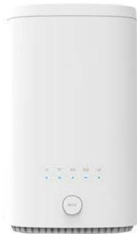
Figure 2 Indicator