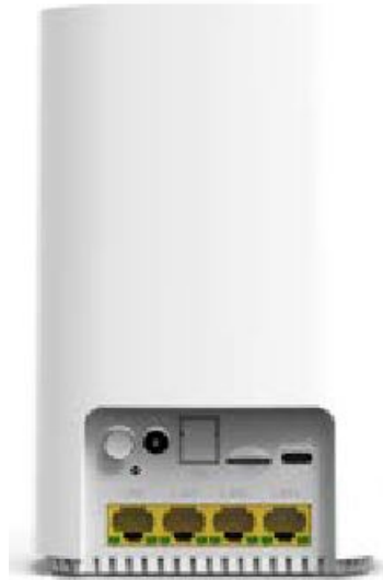
Figure 1 Interface