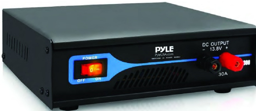
PSV300 Compact Bench Power Supply AC-to-DC Power Converter (30 Amp) User Manual

Your PSV300 Heavy-Duty 30-Amp Switching DC Power Supply is designed to use AC power-to-power equipment that requires 12V DC automotive power. The power supply converts standard 120V AC household power to 13.8V DC power and can supply up to 30 amps of continuous power.