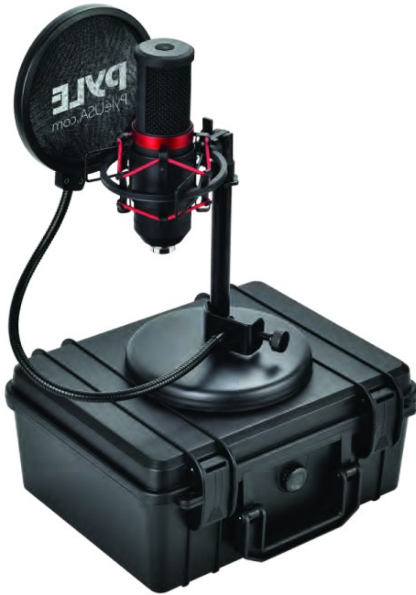
PDMIKT200 Computer Desktop Microphone User Manual

Streaming & Pro Audio Recording Mic Kit with Shock Mount Stand, Easy USB Plug-and-Play (for Podcast Recording, Streaming, Gaming)