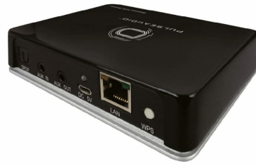
PULSE AUDIO PASTREAM2 Streaming Audio Receiver