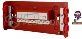
pulsar AWOP-360PR Distribution Junction Box