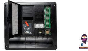
Progressive Dynamics PD4500 Series Power Control Center